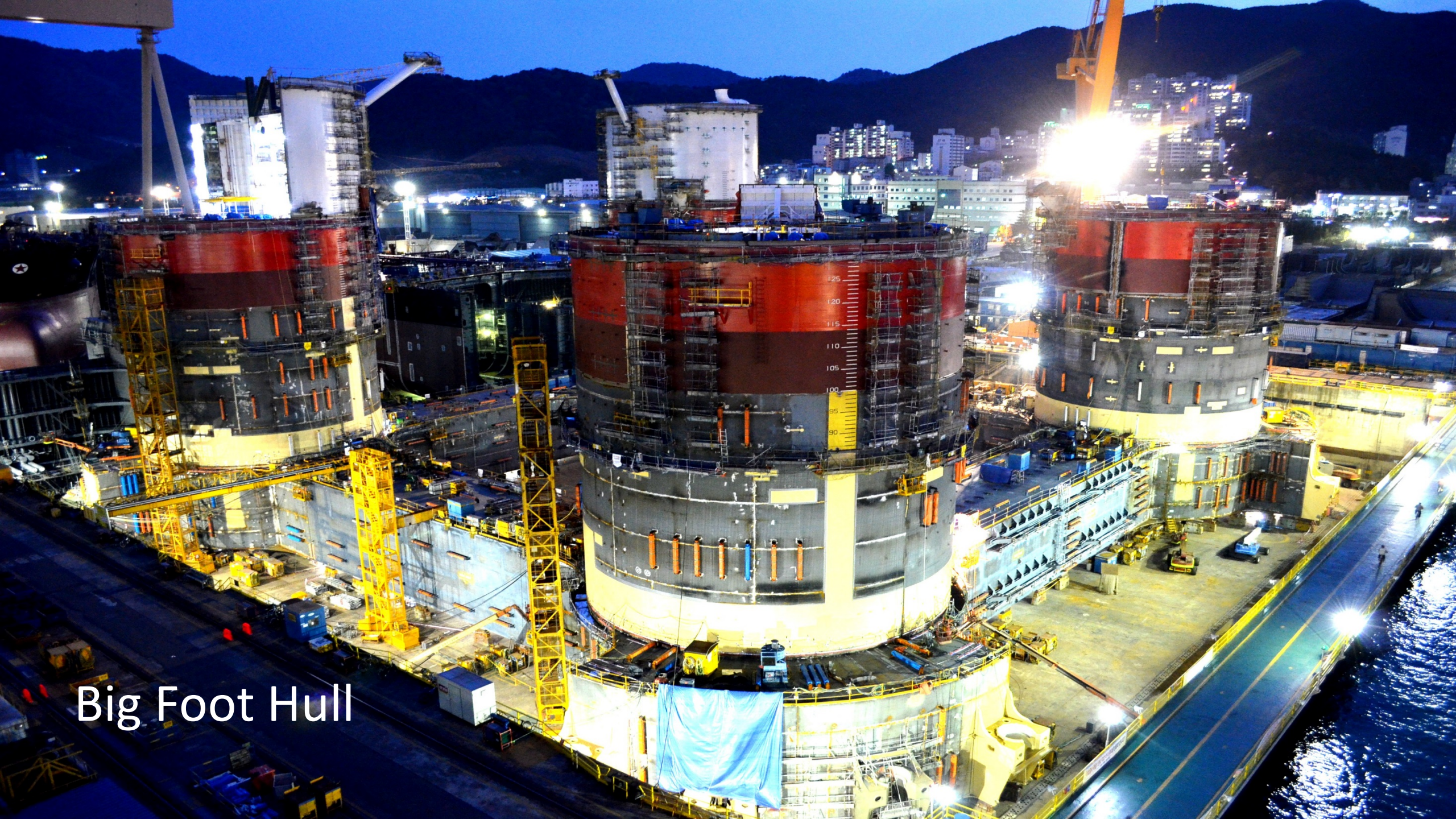
Big Foot Hull