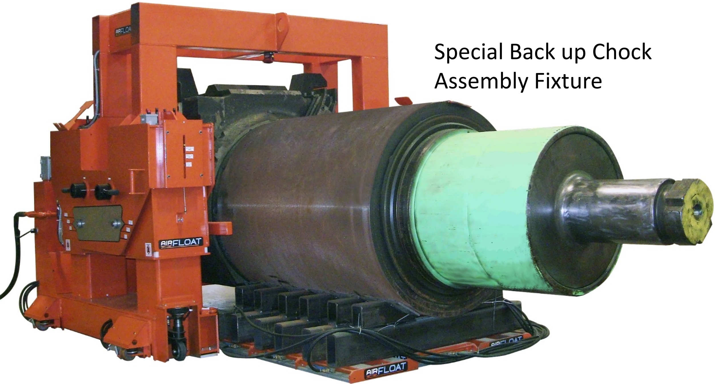
Special Back up Chock Assembly Fixture